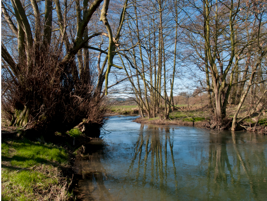
River Lugg, a tributary of the Wye, near Presteigne.

Befriend your local river and join us to use people-power to understand what is happening and what we can do to save the Lugg and Upper Wye.